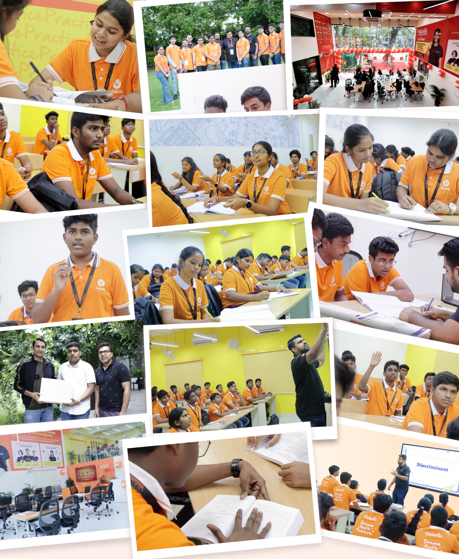
Our Offline Centres at a Glance